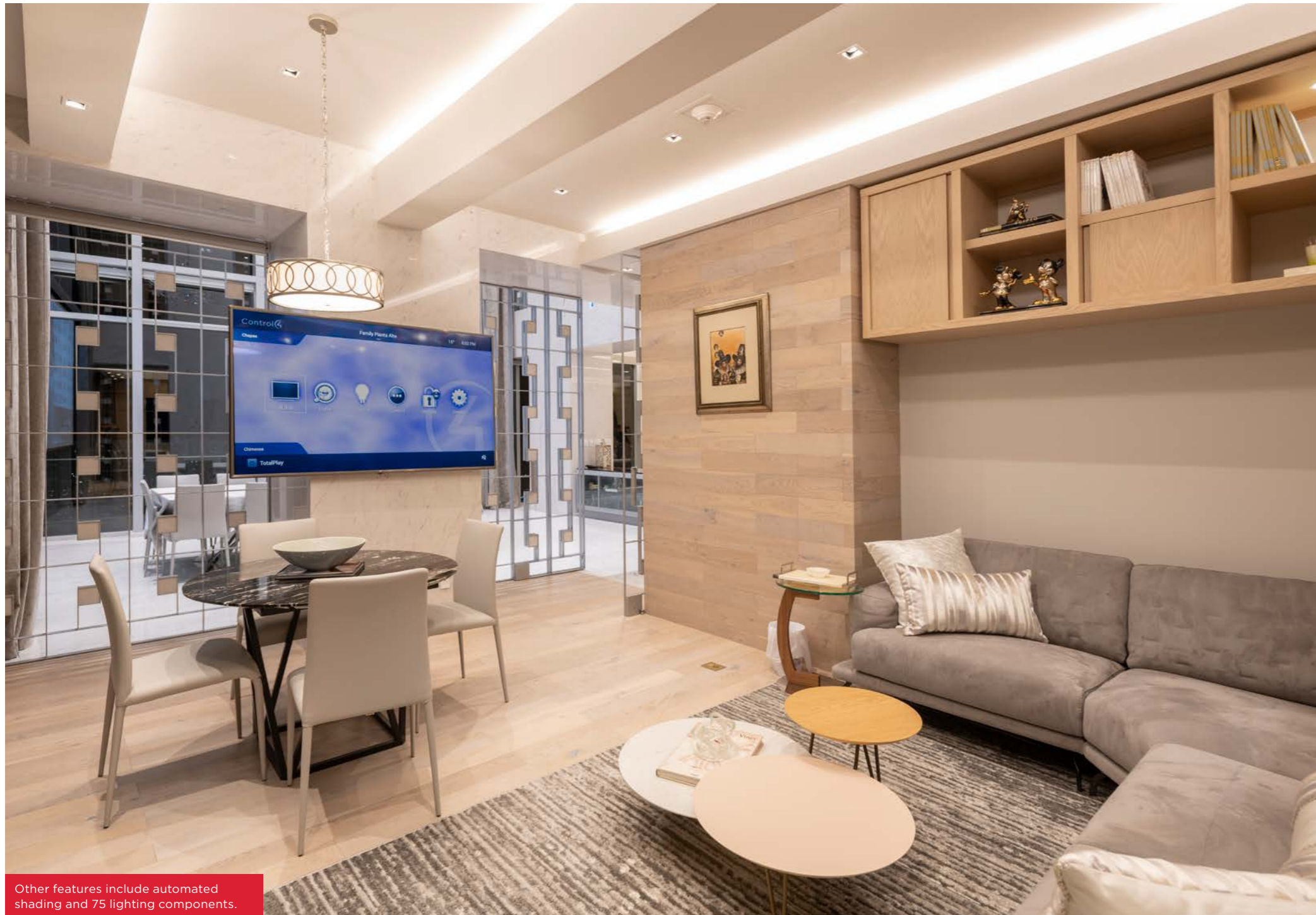
Other features include automated shading and 75 lighting components.