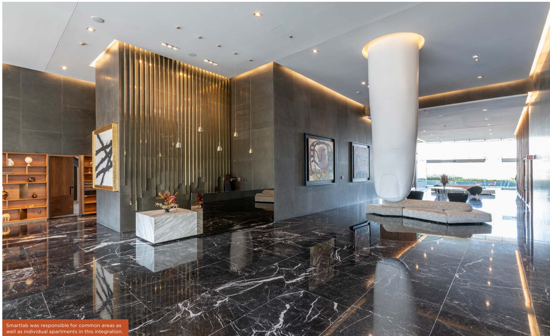
Smartlab was responsible for common areas as well as individual apartments in this integration.