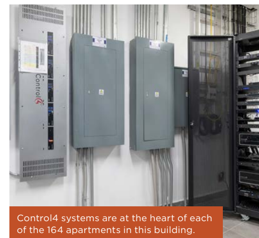
Control4 systems are at the heart of each of the 164 apartments in this building.

THE POWER OF HOME AUTOMATION IS INCLUDED IN ALL 164 UNITS OF THIS LUXURIOUS RESIDENTIAL DEVELOPMENT.